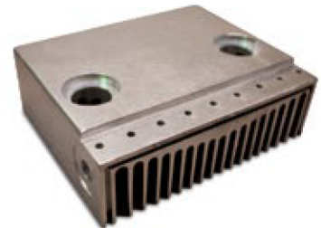
Replacement Heat Sinks

Best Pricing in the Industry We also refurbish Chopper Modules and Auxiliary Inverters