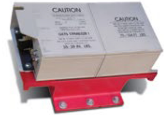
GTO Phase Module and GDU Testing The only Company in the industry performing these proprietary testing procedures.