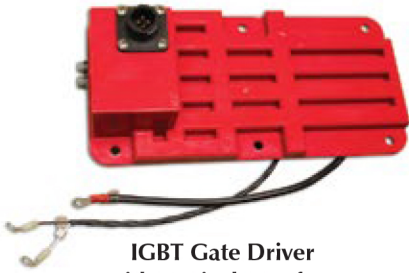
IGBT Gate Driver with Optical Interface