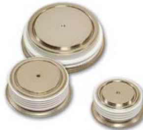
Freewheeling & Snubber Diodes