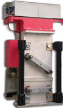
GTO Phase Module Repair / Refurbish / Replacement